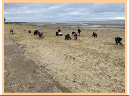
Working together for a successful future