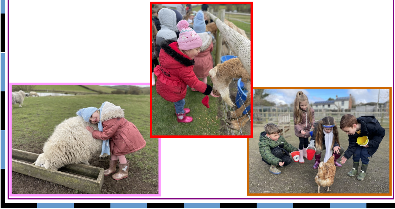
Working together for a successful future

The children in Year 1 are learning about animals this half term. In class this week they have been talking about different types of animals including pets, zoo animals and farm animals. This week the 1CE Out and About group visited Nettlecombe Farm in Whitwell to help feed the farm animals. The children hand fed the chickens, goats, donkeys and various different breeds of sheep. At Nettlecombe Farm they raise the animals as pets and have a variety of rare breeds. The children learnt about the animals teeth, what food they like to eat and about their feet or hooves. The children especially liked the little Ouessant sheep. They originate from France and they are one of the smallest breed of sheep in the world!