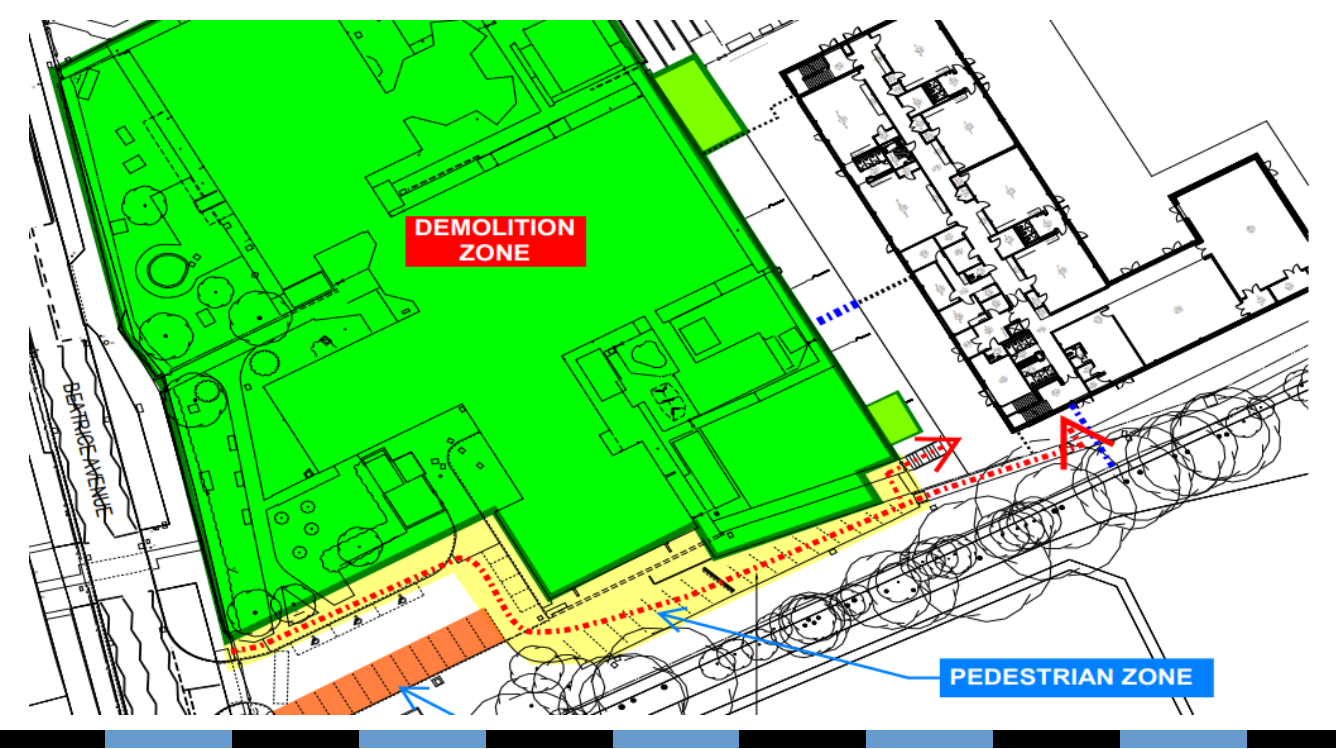
Working together for a successful future

Please see map below showing new access into the new school building.