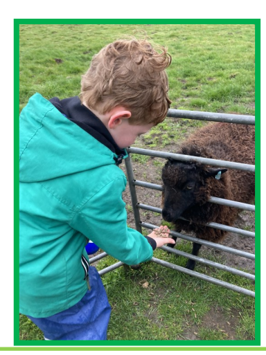
Working together for a successful future