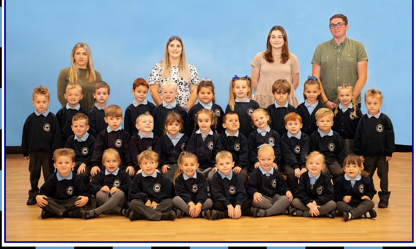
Working together for a successful future