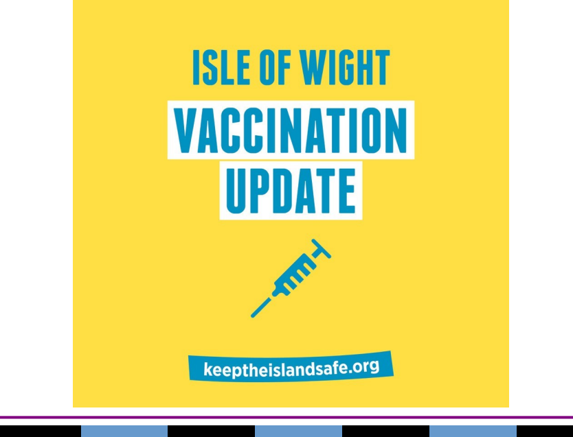
Working together for a successful future

Get information and support with COVID-19 on the Island on keeptheislandsafe.org