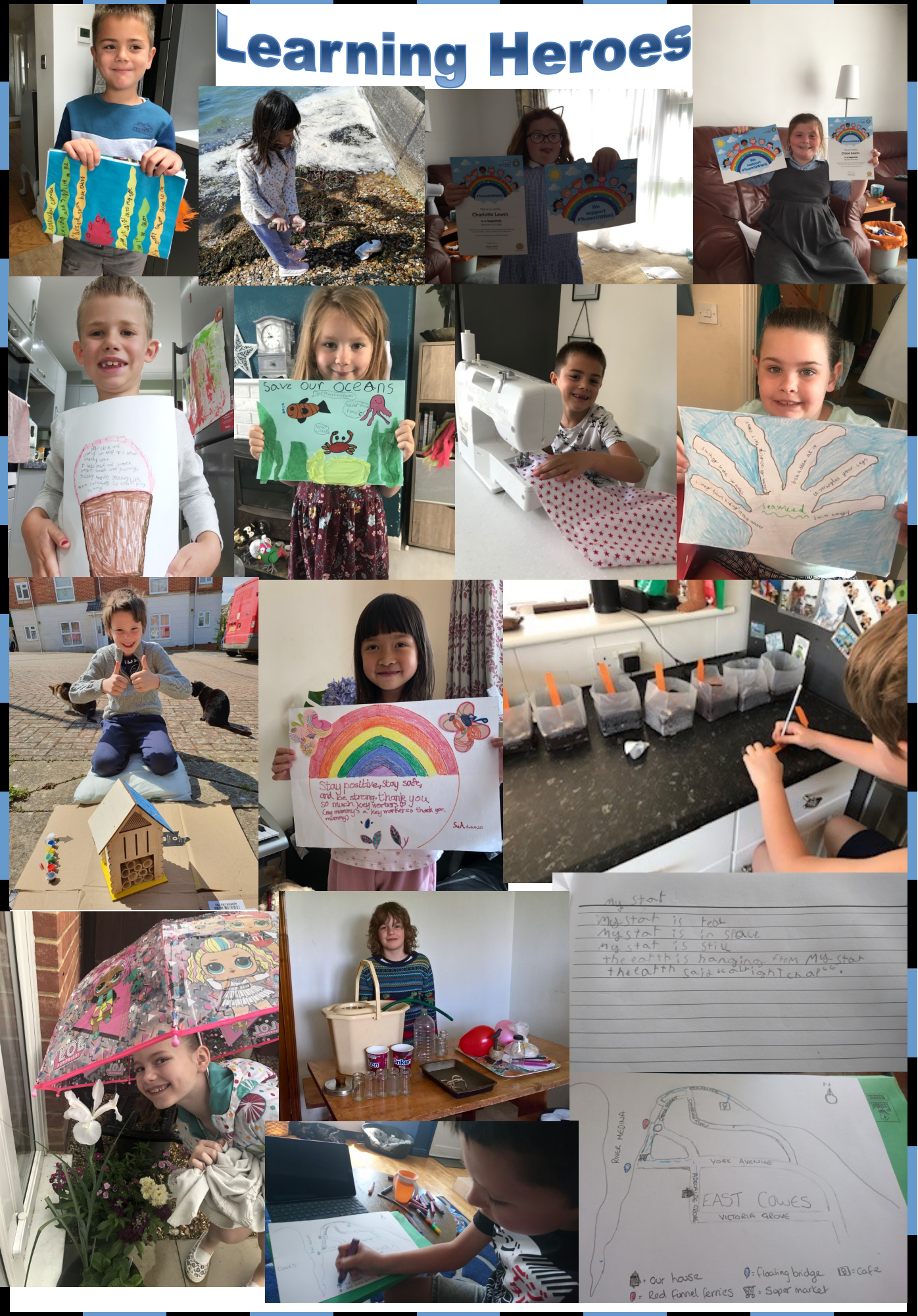
Working together for a successful future