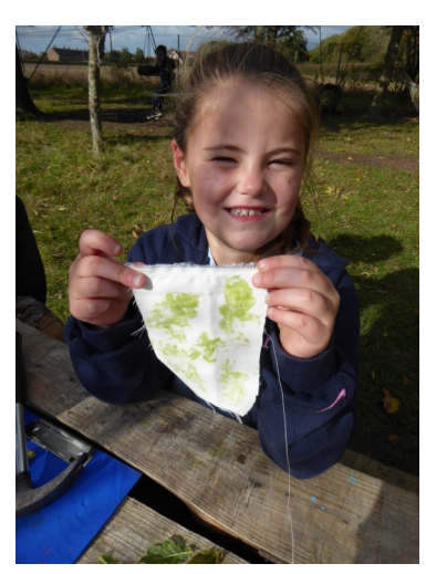
Working together for a successful future