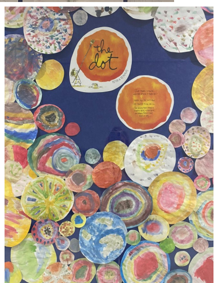
Working together for a successful future