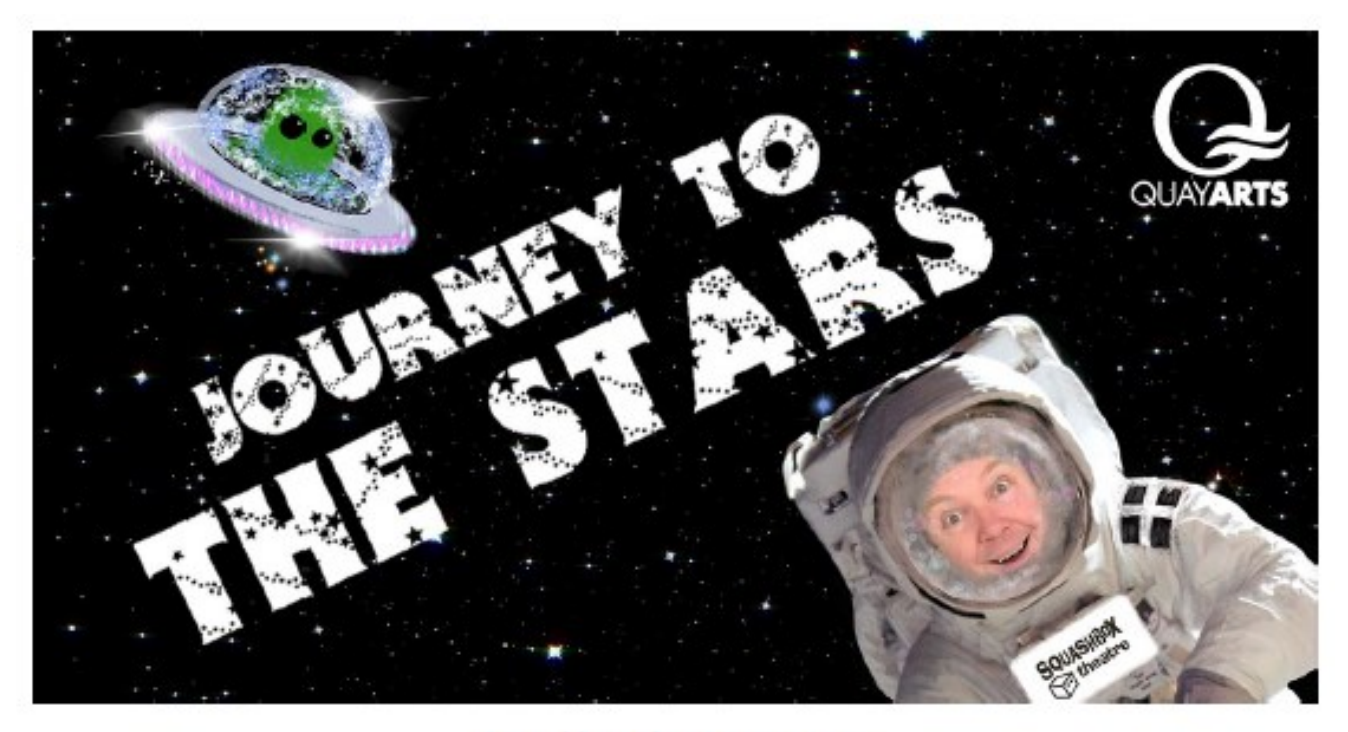
Squashbox Theatre presents...