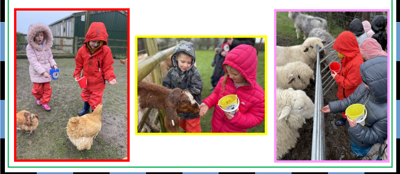
Working together for a successful future

The 1SG Out and About team visited Nettelcombe Farm in Whitwell on Wednesday morning. The children have been learning about animals this half term so had the chance to get hands on and find out more about farm animals. They fed the chickens, which pecked the grain from the palm of their hands. The children learnt the red bit on a chicken's head is called a comb and the bit under their chin is called a wattle. We looked at their feet and could see they have three toes at the front and one at the back, used for stability or to dig with. They then fed the goats and a variety of breeds of sheep. The children were amazingly confident hand feeding them and learnt that they only have front teeth at the bottom. After meeting the alpacas, we went to the stables to feed the donkeys their carrots! A huge well done to the group for being so well mannered and enthusiastic, despite the very wet and windy weather we had throughout their visit.