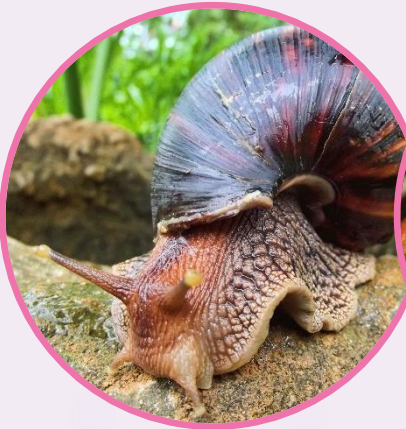
African land snail

These animals need lots of special care to keep them happy and healthy.