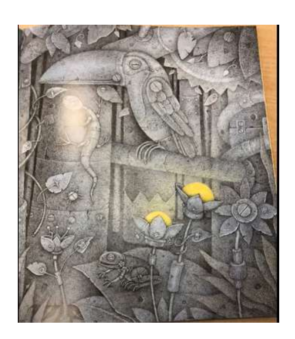
The tin forest