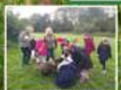
Woolton —Great, children kept busy and engaged throughout. Instructors, top quality, clearly experienced.