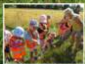
Greenhouse —Activities were fun and informative. Instructors knowledgeable and enthusiastic.

Reduced prices are available until the grant is exhausted 1 session/school or 2 if there are 2 cohorts/yr 1 discounted visit per school