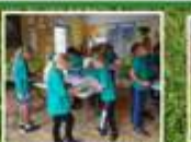
Garden and Lake —Better than expected. We have had an amazing time.