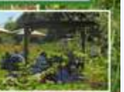
Arretton —The Rosebush detective activities were very scientific and covered a lot of our objectives.