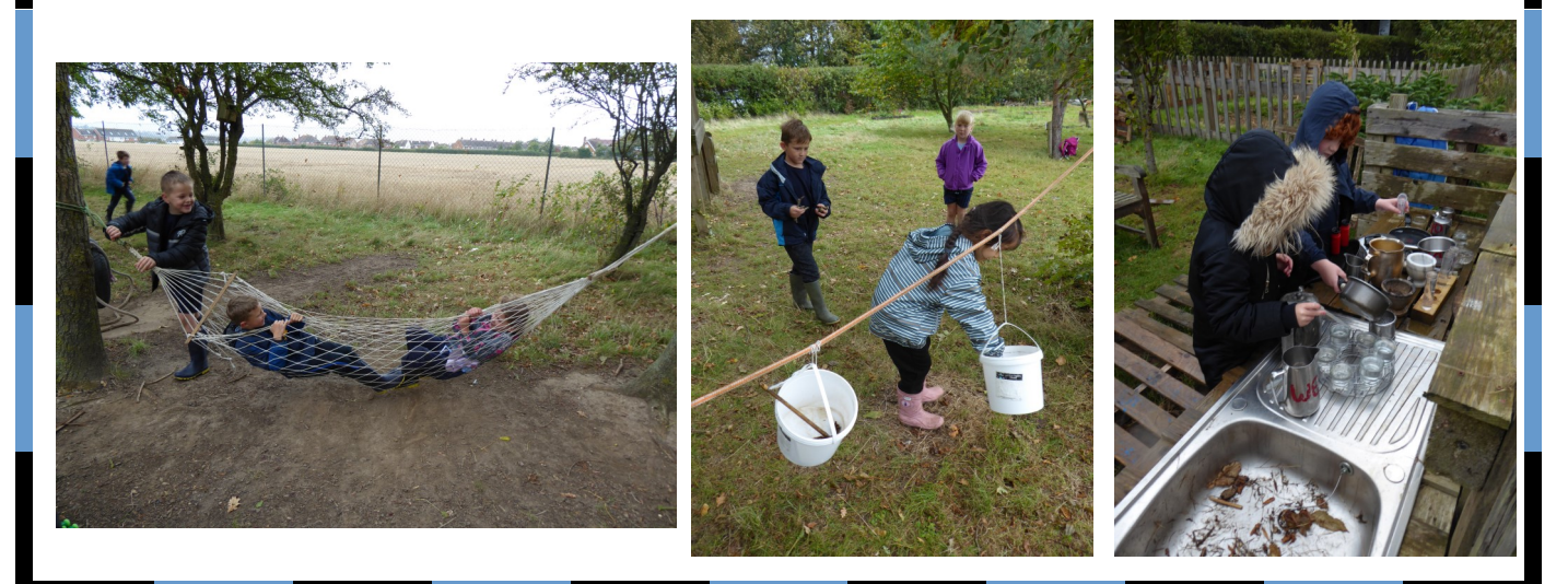
Working together for a successful future

All of 2GC enjoyed some Out and About time on the Patch in the rain on Wednesday afternoon. The children have been practising the graphemes oi and oy in phonics. They had fun throwing pine cones and acorns into the sound buckets, hunting for real and nonsense words to feed Obb and Bob as well as exploring the Patch.