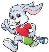
Working together for a successful future