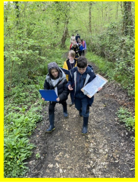
Working together for a successful future